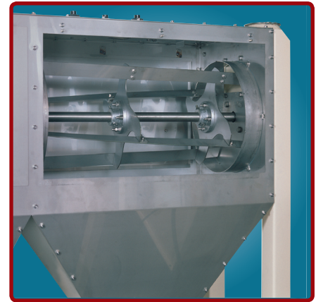
Rotor in sifting chamber