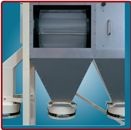
Screen in sifting chamber